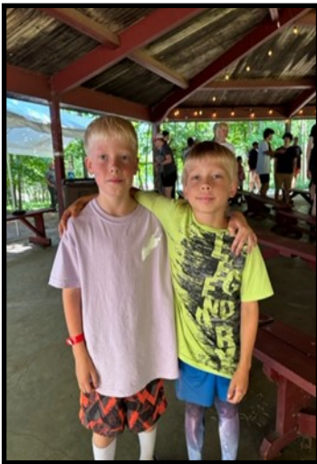
First time campers!

Love is patient, love is kind. It does not envy, it does not boast, it is not proud. 5 It does not dishonor others, it is not self-seeking, it is not easily angered, it keeps no record of wrongs. 6 Love does not delight in evil but rejoices with the truth. 7 It always protects, always trusts, always hopes, always perseveres.